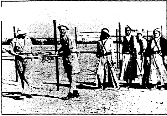
Jewish settlers building a fence around land in Palestine in 1946

Jewish immigration into Palestine Beginning in 1882, waves of Jews began immigrating to Palestine. After 1900, the majority of immigrants were Zionists, who established socialist farming communities. By 1914, Jews made up almost 10 percent of Palestine's population. The Christian Palestinians, who felt little connection to Muslim Ottoman rulers, increasingly feared that Zionism was an extension of European colonialism in Palestine. Eventually, increased Jewish immigration and land purchases intensified fears of Zionism