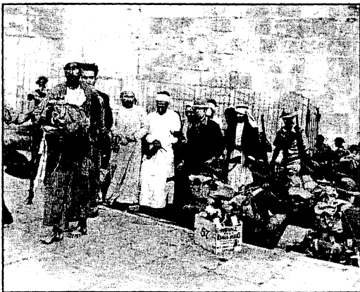
Arab prisoners being escorted through Jerusalem by British troops in 1938

The British Mandate of Palestine In 1916, Britain and France signed a secret agreement called the Sykes-Picot Agreement, which called for the partition of Ottoman Empire lands in the Middle East after World War I. According to this agreement, Britain would take control of Palestine. During this time, Zionist leaders lobbied the British to allow for a Jewish state in Palestine. In 1917, the British government issued the Balfour Declaration, which expressed British support for the "establishment in Palestine of a National Home for the Jewish people." The British did not consult Palestinian Arabs, who made up almost 85 percent of the population, and Palestinians opposed the declaration as a violation of their rights. The declaration was seen as a great diplomatic victory for Zionism, and Jewish immigration into Palestine increased. When the Ottoman Empire fell at the end of the war in 1918, the British officially took control of Palestine as a mandate (similar to a colony). Palestinian Arabs were outraged that although they comprised the large majority of the population Britain had not allowed them to determine how Palestine would be governed. As Jewish immigration continued, Arab-Jewish tensions rose, and by 1929 riots and attacks had left 133 Jews and 116 Arabs dead.